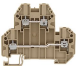
SRKD 2,5 BG