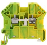
SSL 2,5/2A GNYE