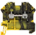
SRK 2,5/2A/PE BKYE