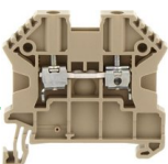
SRK 2,5/2A/Z BG