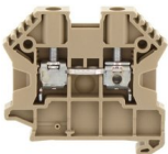
SRK B 2,5/2A BG