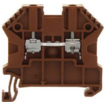
SRK 2,5/2A RB