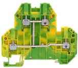
SSLD 2,5 GNYE