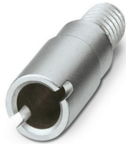
Test plug strip, number of positions: 1, color: silver-colored

Please be informed that the data shown in this PDF document is generated from our online catalog. Please find the complete data in the user documentation. Our general terms of use for downloads are valid.