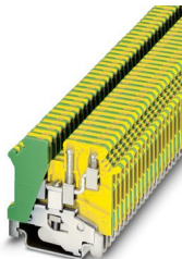
Protective conductor terminal block, connection method: Screw connection, 1 level, cross section: 0.2 mm 2 - 2.5 mm 2 , mounting type: NS 35/7,5, NS 35/15, NS 32, color: green-yellow

Please be informed that the data shown in this PDF document is generated from our online catalog. Please find the complete data in the user documentation. Our general terms of use for downloads are valid.