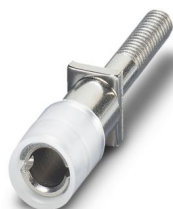
Test plug strip, number of positions: 1, color: green

Please be informed that the data shown in this PDF document is generated from our online catalog. Please find the complete data in the user documentation. Our general terms of use for downloads are valid.