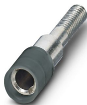
Test plug strip, number of positions: 1, color: black

Please be informed that the data shown in this PDF document is generated from our online catalog. Please find the complete data in the user documentation. Our general terms of use for downloads are valid.