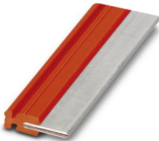
Single plug-in bridge, length: 50 mm, color: red

Please be informed that the data shown in this PDF document is generated from our online catalog. Please find the complete data in the user documentation. Our general terms of use for downloads are valid.