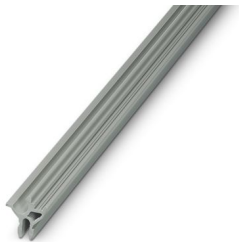
Holding profile, snaps into the cover holder APK-TU, with groove for Zack strip ZB 5 to ZB 10, length: 2 m

Please be informed that the data shown in this PDF document is generated from our online catalog. Please find the complete data in the user documentation. Our general terms of use for downloads are valid.