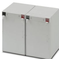
Replacement battery, VRLA-AGM, 2x12 V DC, 12 Ah

Please be informed that the data shown in this PDF document is generated from our online catalog. Please find the complete data in the user documentation. Our general terms of use for downloads are valid.