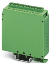
Electronic housing, for PCB insertion, with 12-pos. Combicon pin strip

Please be informed that the data shown in this PDF document is generated from our online catalog. Please find the complete data in the user documentation. Our general terms of use for downloads are valid.